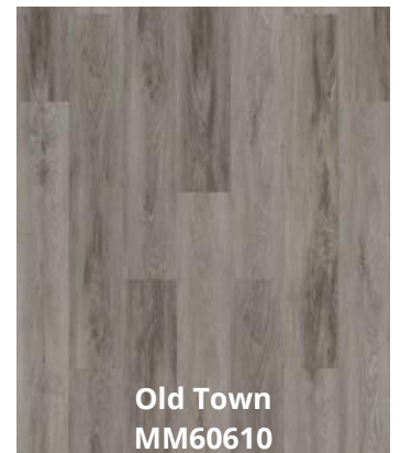
Old Town MM60610