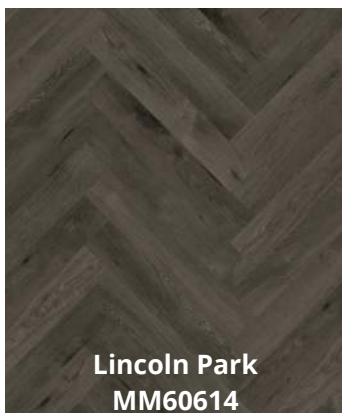
Lincoln Park MM60614