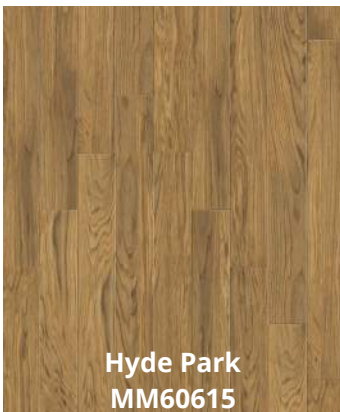
Hyde Park MM60615