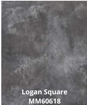
Logan Square MM60618