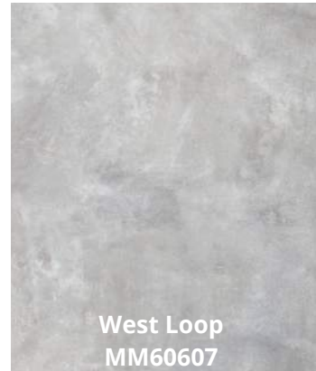
West Loop MM60607