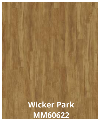
Wicker Park MM60622